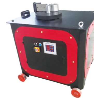
GF32D Sensor type