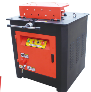
GWH32E SPIRAL REBAR BENDER