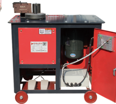
GF20D Sensor type