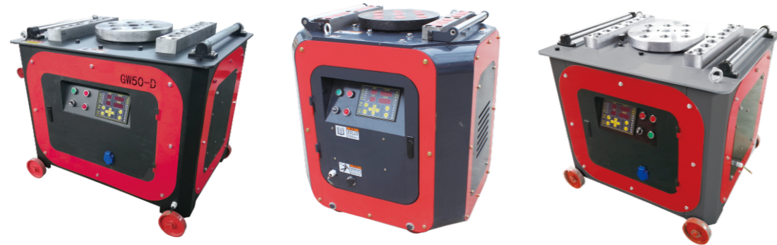
GW50D Sensor type